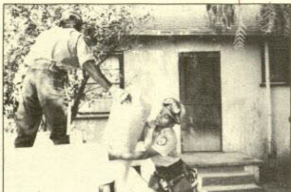
Weatherization and energy programs play an important part in moving Riverside County residents out of poverty. Weatherization programs include insulating homes as shown in this photo, installing water-saving devices and educating consumers about saving energy as shown in the photos below.

I also think we've seen less competition and more cooperation develop in our community. We really felt early on that we had to promote collaboration because when I talked to our partners, we had the least to put on the table. The major resource we took was us — our staff — and our willingness to do the work. We have constantly said we didn't want to compete with our network of CBOs but complement them and support them. I think that's something we have really done well."