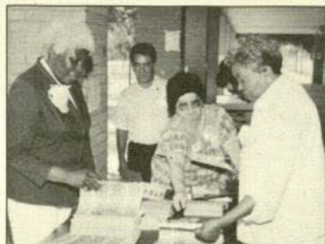
Two DCA supporters prepare for a women's conference sponsored by DCA.

"At the state level, there are two entities: the Cal/Neva Community Action Association, which has evolved into a very fine, skilled professional organization. I can remember when it was just a shoebox organization and we didn't even know where we were going to get the money to pay the one staff person we had. It has really evolved into a great organization that serves its membership but also administers projects that we individual agencies would not do. Over on the other side is the state Department of Economic Opportunity. First of all, we've seen an evolution in the name: it used to be the Office of Economic Opportunity, under the Executive Branch. Now it is a state department. We've seen seven or eight new directors go through there like a revolving door. I believe it is the most stable it has ever been at this point in time. Community Action agencies have probably done more to contribute to the stability and effectiveness of the state