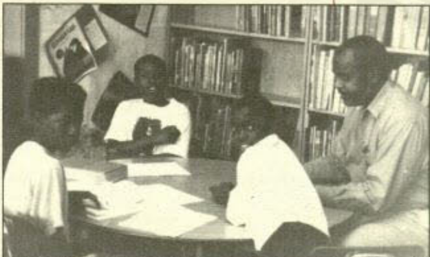
Youth intervention and diversion programs are sponsored annually by the Department of Community Action. This includes a tutorial program for minority children formerly held at Emerson Elementary School in Riverside.