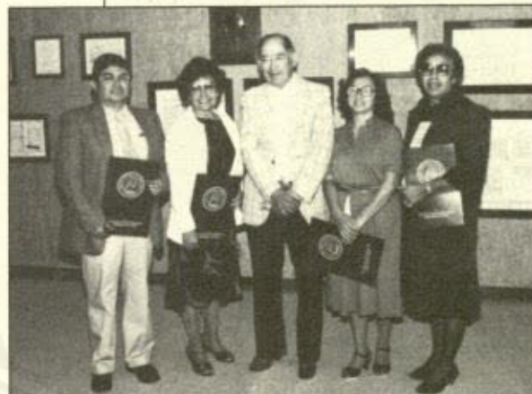
The DCA coordinates both the Black History Month and Cinco de Mayo recognitions by the Riverside County Board of Supervisors each year. The events honor both Riverside County employees and citizens from each district.

"I think we've seen our CBOs reach a high level of expertise. They've come for