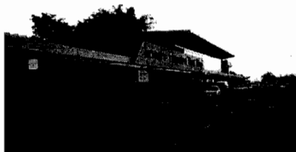
Guadalajara's Hidalgo International Airport, site of the 1993 assassination of Roman Catholic Cardinal Juan Jesus Posadas Ocampo by San Diego Calle Treinta gang members on behalf of the Tijuana-based Arellano-Felix cartel.

Tuesday March 13: I returned to Guadalajara. I met with the US Consulate's Public Affairs Attaché and Education Deputy to discuss their role in assisting with the creation of a 2-3 week SDSU study abroad course in Guadalajara during the summer of 2002. I then picked up SDSU students from the Guadalajara airport for the beginning of Phase II.