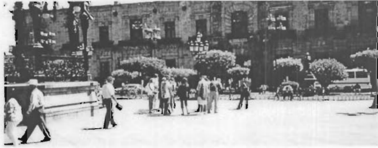
SDSU students in front of the old Governor's Palace in Guadalajara.

My trip to Guadalajara met with the following results: