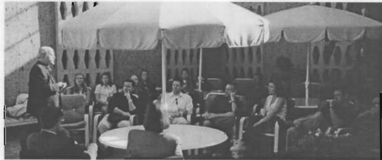
SDSU, USD and ITESO faculty and students listen to a presentation from the US Counsel General to Guadalajara.

Wednesday March 13: The SDSU and USD teams were joined by ITESO students and faculty for a visit to the US Consulate in Guadalajara. The Counsel-General, his Chief of Staff and the Public Affairs Director gave talks on the Department of State's role in the War on Drugs.