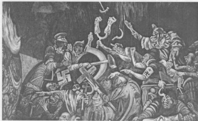
Orozco's vision of the devastation of the 20th Century on Mexico. If painted today, it would surely include the War on Drugs.

Saturday March 16: I took the SDSU contingent and a few USD students on a tour of historical and cultural sites throughout Guadalajara. Of particular note were the murals of Orozco located in the old Jalisco government building. These murals poignantly illustrated the Mexican mind-set towards its exploitation by fascism, communism, socialism, capitalism and imperialism. As one student astutely commented, "Orozco surely would have included the War on Drugs if he were alive today!"