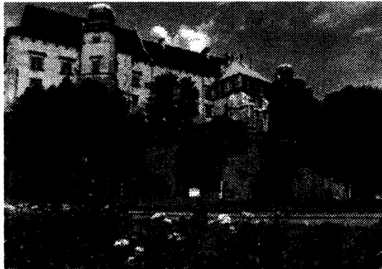
Wawel Royal Castle

Krakow consists of an inner town and several suburbs. The city contains a large number of historic buildings. The most notable is the Royal Castle and Gothic Cathedral on Wawel Hill.