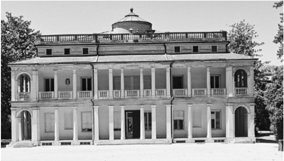
Mendrisio campus: Villa Argentina