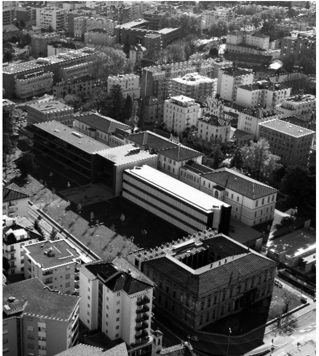
Lugano Campus: aerial photo

Bicycles You may buy a cheap bicycle from Soccorso Operaio: Soccorso operaio svizzero SOS, Atelier RI-cicletta, Via Zurigo 17, 6900 Lugano, (Phone +41 91 921 01 02), Opening hours: Monday-Friday: 8 am – 12 noon and 13 – 17 pm