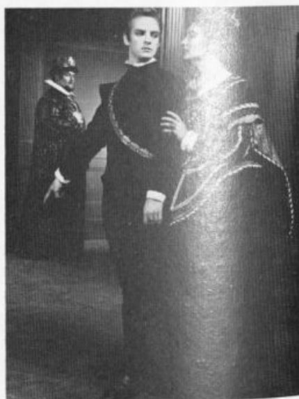
Victor Buono as Claudius

Claudius has murdered his brother, the King of Denmark. Usurping the throne, with unseemly haste he weds Gertrude, the widowed Queen. Young Prince Hamlet, the rightful heir to the throne, meets the ghost of his dead father. When the ghost relates the circumstances of his murder and demands retribution, Hamlet swears an oath of vengeance. Hamlet pretends madness. He rebuffs Ophelia, whom he loves, confounds her father Polonius, the lord chamberlain, and dismays the Queen. Setting his "mousetrap," the play within a play that reproduces the circumstances of the murder, Hamlet tricks the King into betraying his guilt. Then the Queen is confronted in her chamber by her son, who upbraids her violently. Thinking he hears the King behind a drapery, Hamlet draws and fatally runs through the eavesdropper, the meddlesome Polonius. Determined to destroy Hamlet, King Claudius sends him to England where hired assassins wait. But Hamlet escapes and returns to Denmark. He arrives to find Ophelia being borne to her grave. Mad with grief, she has drowned. Meanwhile, her brother Laertes has returned from France to revenge their father's death. At the King's instance, Hamlet and Laertes duel. Hamlet perishes from Laertes' poisoned foil, but already he has given Laertes a mortal wound and stabbed the King, who has inadvertently slain Gertrude with a poisoned cup intended for Hamlet, the tragic Prince of Denmark.