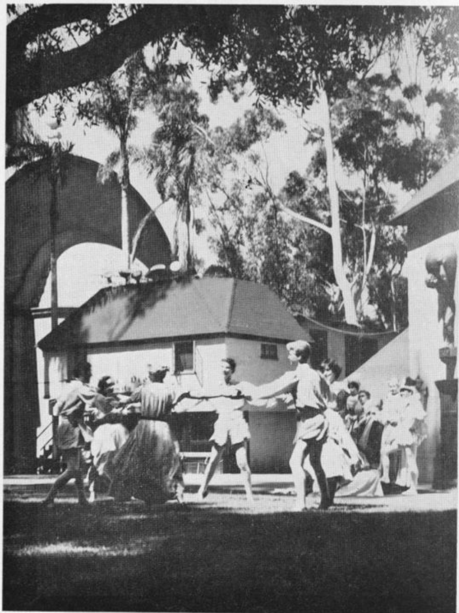
COMPLIMENTS OF A PATRON